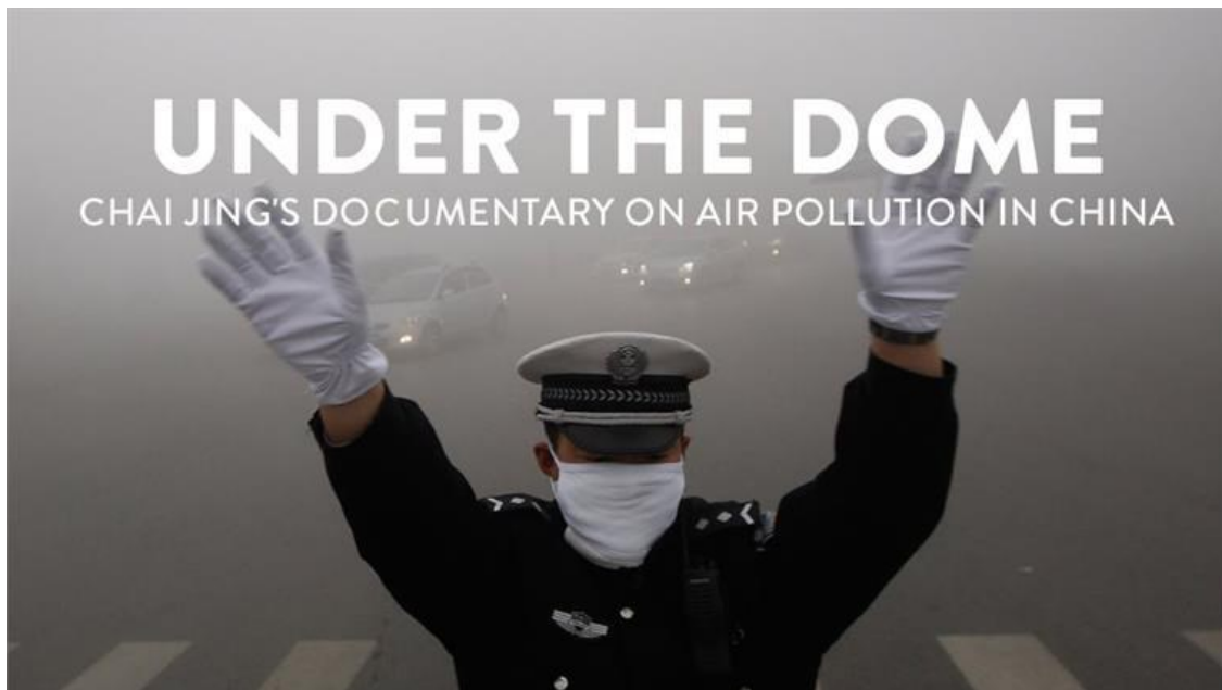
Under the Dome