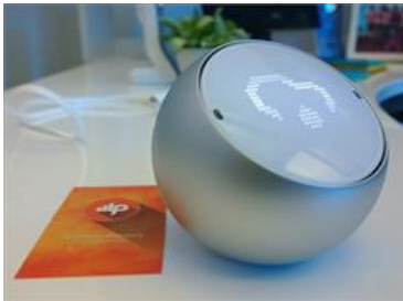
Airnut indoor station