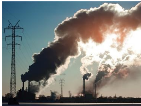
Only eight of China's 74 biggest cities passed the government's basic air quality standards in 2014