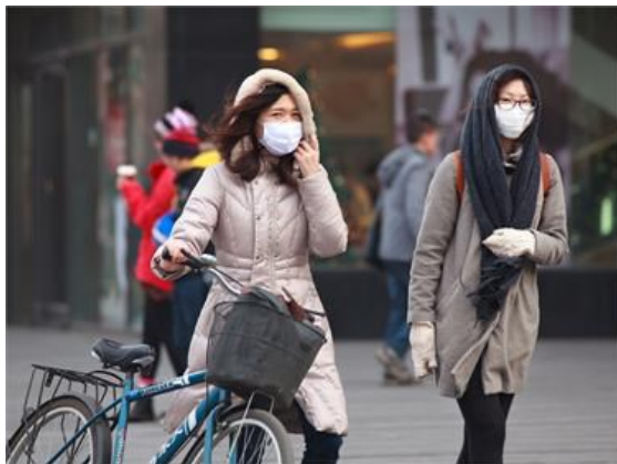
Some 47% of Chinese consumers aged 20-49 are concerned about catching incurable diseases due to environmental problems